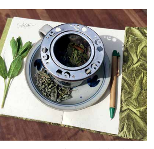
▲ Studying a single herb, such as sage, is both productive and enjoyable.

includes a central herb that is complemented by additional ingredients chosen for flavor, balance, and benefit.