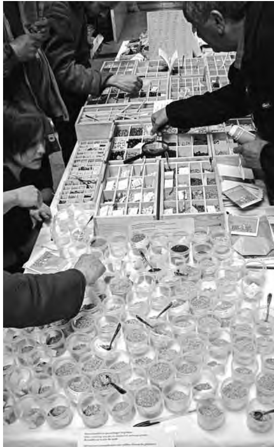
Small-scale seed exchanges and wider networks are helping to maintain crop diversity in the face of corporate seed control and monoculture farming.