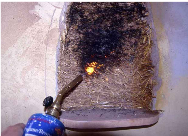
Even with the intense heat application of a blow torch, LSC only smolders.