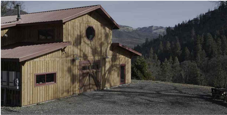
A board-and-batten rainscreen keeps the wind-driven rain from saturating the LSC on the south side of this handsome brewery.

Other applications of light straw clay are ceilings and floors. LSC can be used between floor joists if permanent formwork is used, or by implementing what is referred to as “light earth reels” (Volhard) or “chorizo style” (they look like sausage rolls), where the straw clay is wrapped around a stick or bamboo rod and suspended between the floor joists. Adequate airflow must be