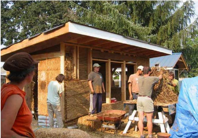
Straw bales are load bearing in this building that uses LSC for the south wall.

One of the advantages light straw clay has over cob and adobe and other natural wall systems is that it slumps and sags very little while being installed, allowing an entire wall cavity to be filled in one work session. As long as tamping is consistent and there are not long periods of drying time between installations in the same wall/stud cavity, there is also very little shrinkage.